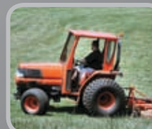
HYDRAULIC LINE REPAIRS