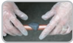
1. Apply Epoxy Putty