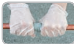
4. Tighten for Approx 4 Min