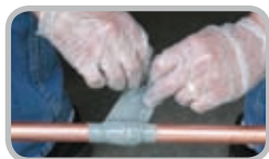
3. Wrap Pipe