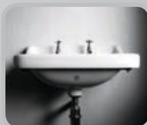
PIPE & PLUMBING

REPAIR ALMOST ANY MATERIAL & PIPES UP TO 6" DIAMETER