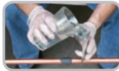
2. Immerse Wrap in Water